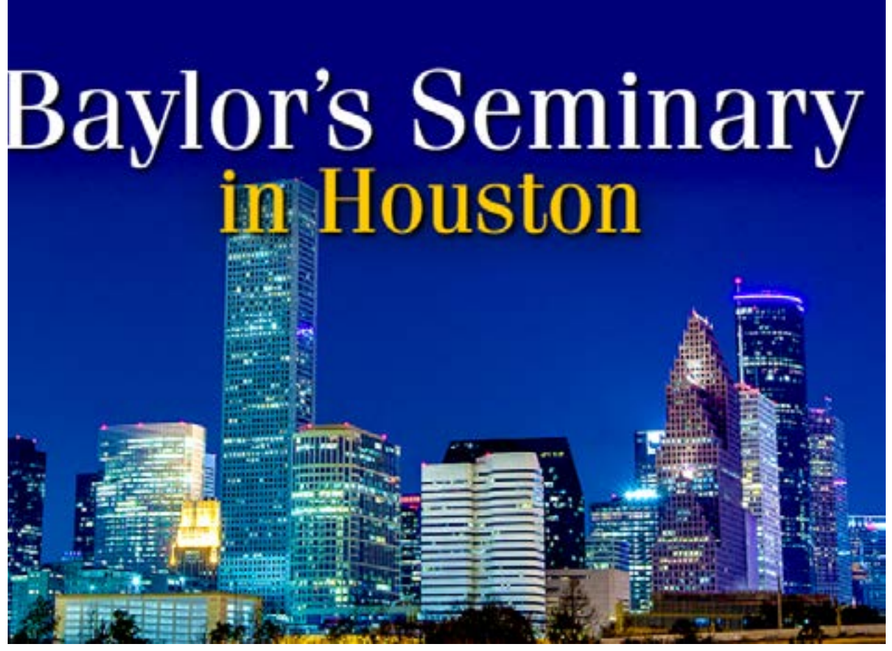
Truett Seminary Opens in Houston in Fall 2017!