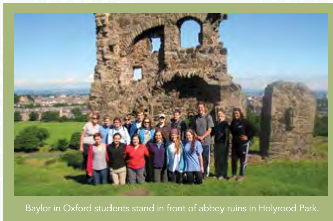
Baylor in Oxford students stand in front of abbey ruins in Holyrood Park.

One of the focal points of the course was the idea of "calling," which incorporates all a person is or does. This is much more than just seeking a job. Baylor in Oxford allows students to learn this important distinction not only in theory, but also by seeing how leadership was practiced in Britain.