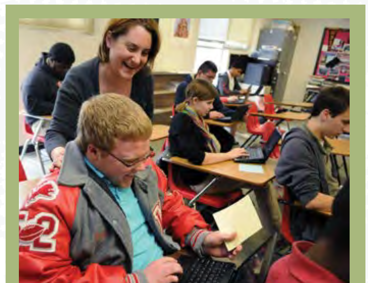
Students at Waco High School enjoy iCivics game play while expanding their knowledge of civics.

Baylor's School of Education and its classroom partners are working on the cutting edge of a new vision in civics education.