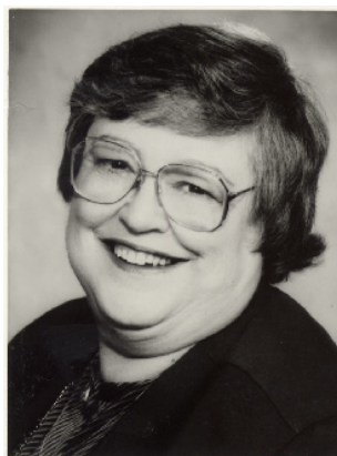
Funds sought for endowment scholarship Story on page 5