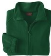
Fitted Princess Seams