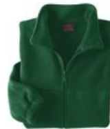
Square Block Styling