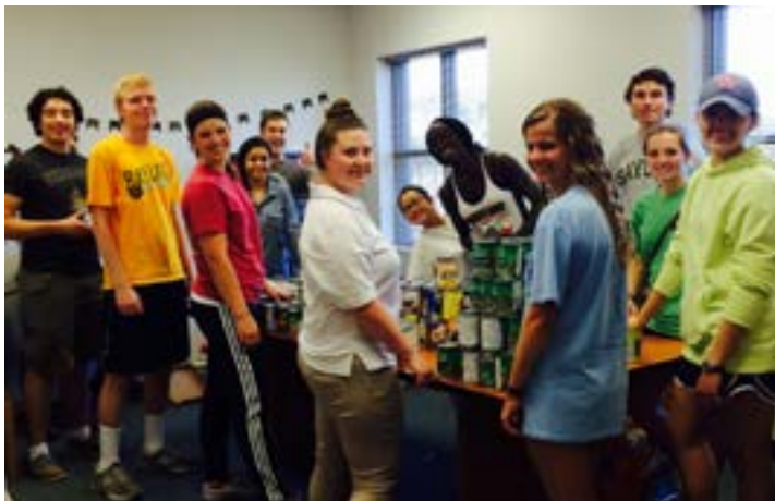
MSO collects canned goods for patients in need

An important part of taking on this clinic project was to help the community served by the clinic in whatever way possible. This prompted a canned food drive for the MLK clinic to give to patients in need. Last semester, 619 cans were donated. This semester, MSO raised 1766 non-perishable food items to stock the clinic's food pantry to overflowing. Way to go MSO and congratulations to your leadership for helping to create such an outstanding partnership with the Family Health Center!