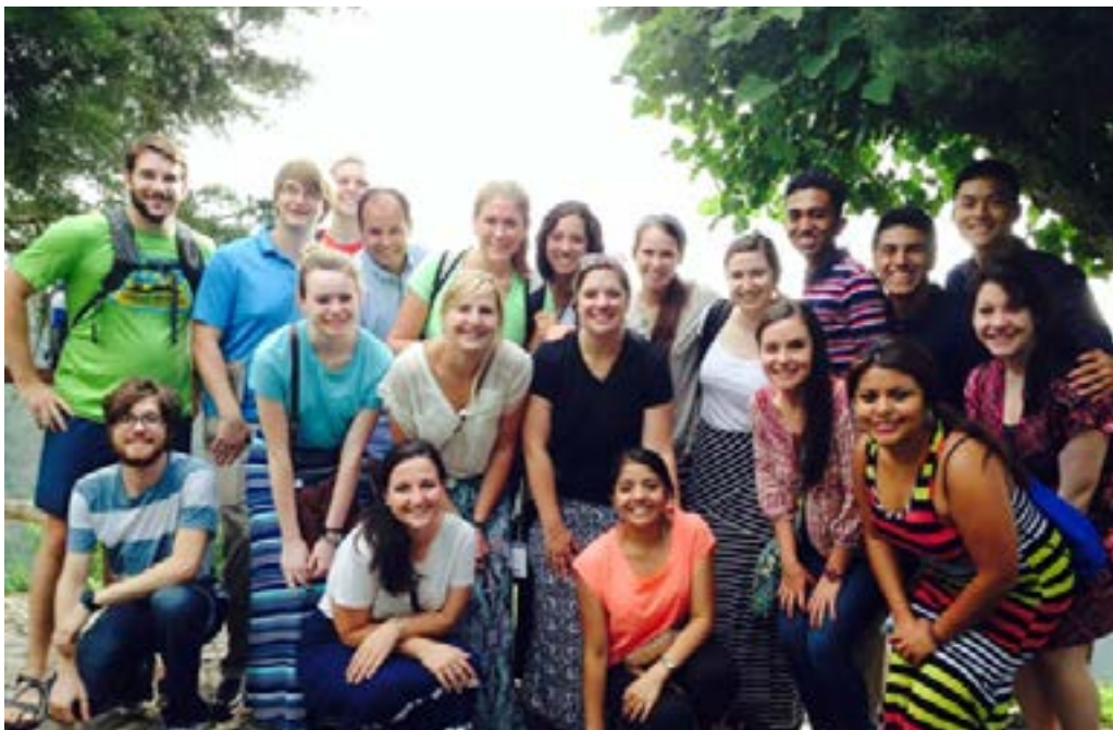
Students spend Spring Break in El Salvador