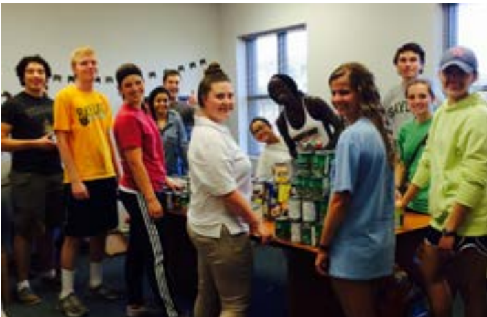
MSO collects canned goods for patients in need

An important part of taking on this clinic project was to help the community served by the clinic in whatever way possible. This prompted a canned food drive for the MLK clinic to give to patients in need. Last semester, 619 cans were donated. This semester, MSO raised 1766 non-perishable food items to stock the clinic's food pantry to overflowing. Way to go MSO and congratulations to your leadership for helping to create such an outstanding partnership with the Family Health Center!