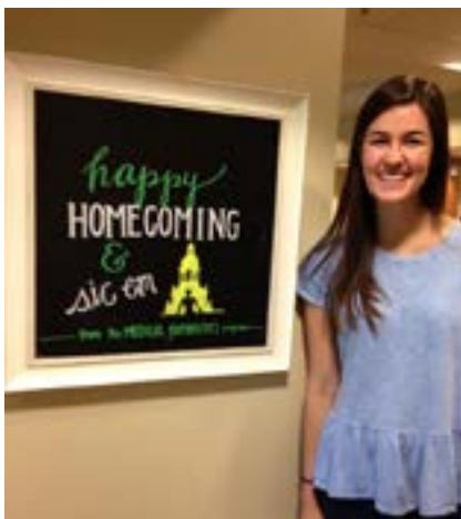
We love our inspiration chalkboard!