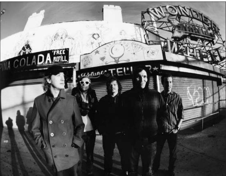
People In Planes mixes hard and soft beats to created an alternative experience in its sophomore release, “Beyond the Horizon.”