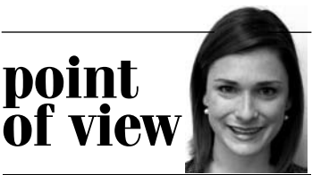
BY LIZ FOREMAN