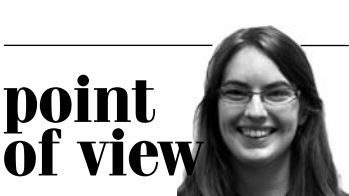
BY JENNIFER SUTTON

According to the Committee to Protect Journalists' Web site, "Without a free press, few other human rights are attainable." Journalists strive for societies with strong press freedoms.