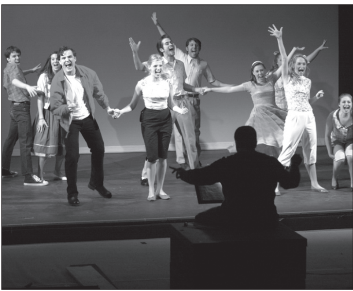
Cast members of Baylor Theatre's Bye Bye Birdie production rehearse Monday night for the opening of the show Thursday.