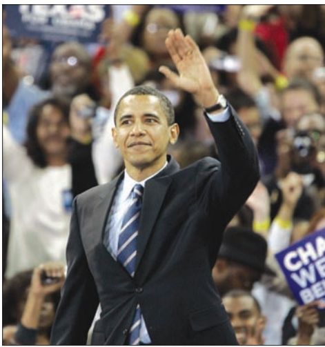
Democratic presidential hopeful Sen. Barack Obama, D-Ill., speaks Tuesday at a rally in Houston.

Sen. John McCain won the Republican primary with ease, dispatching former Arkansas Gov. Mike