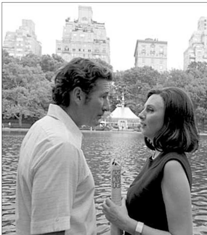
Richard Gere stars in The Hoax with Hope Davis. The movie begins playing in theaters Friday.