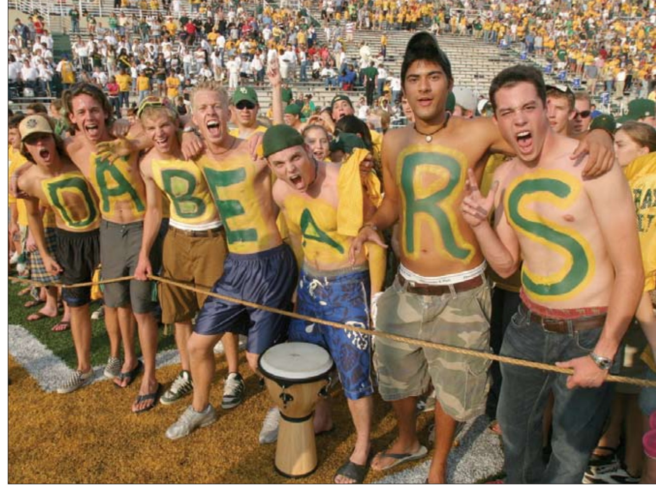
Rowdy Baylor freshmen rush the field before each football home game as part of the Baylor Line. Some students paint their bodies

and faces cheer on the Bears, while some resort to verbal confrontations with opposing teams' fans.