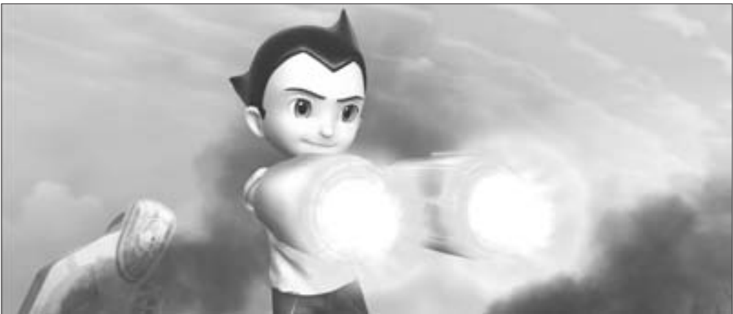
'Astro Boy', a cultural phenomenon in Japan, is coming to American theaters this weekend. The film tells the story of the character who, after being created by a scientist, becomes involved with everyday humans.

When the famous Metro City robotics scientist Dr. Tenma (voice of Nicolas Cage) loses his son, he replaces him with a robot boy — and then rejects his creation as an unsuitable substitute.