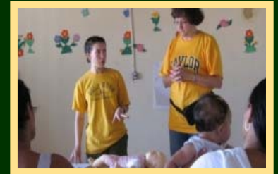
practica, internships, & theses