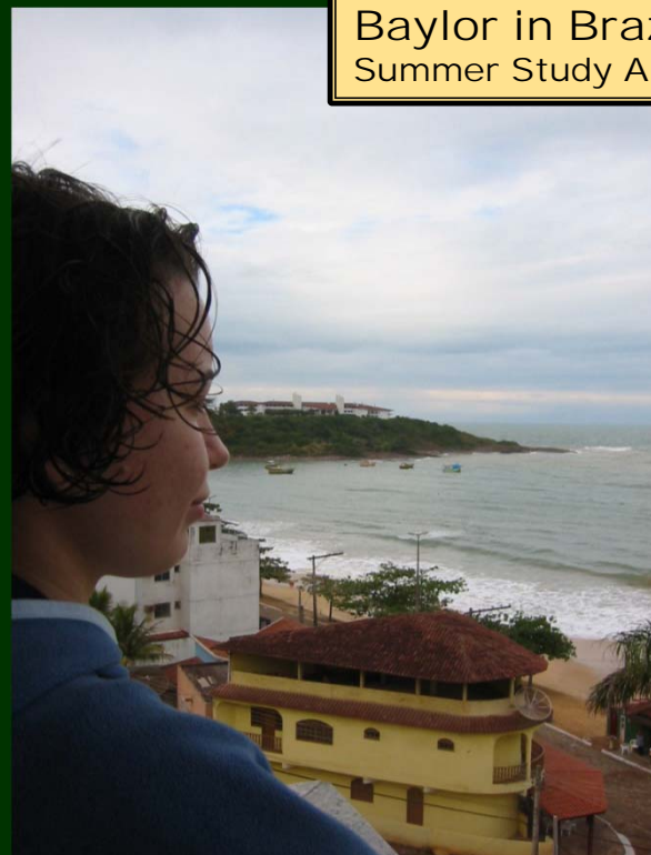
Baylor in Brazil Summer Study Abroad