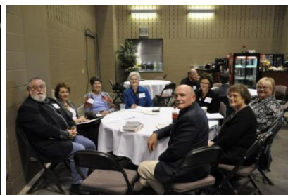
After the program, the board and editors met and discussed business and visions for the organization.