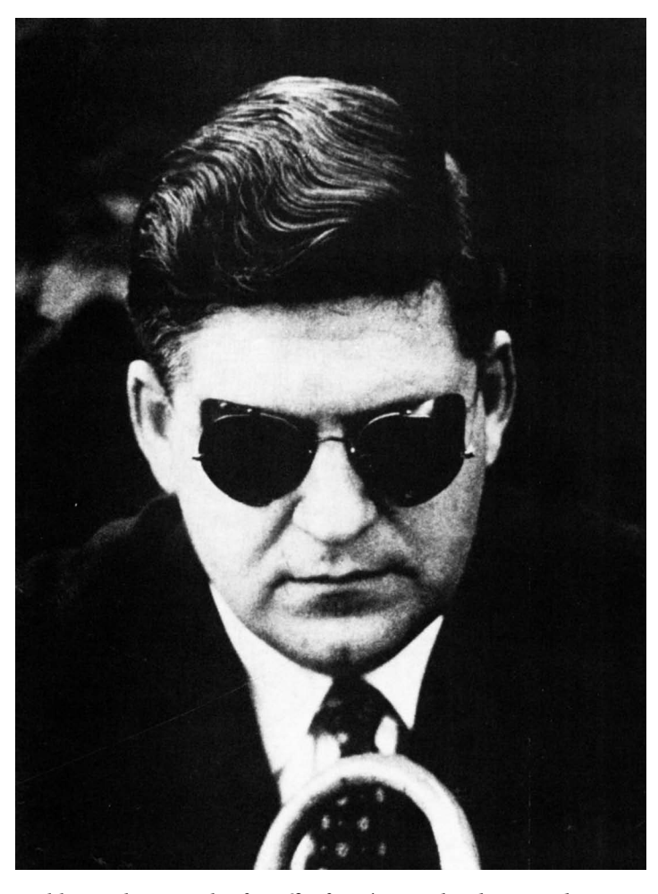
Publicity photograph of Griffin for The Devil Rides Outside , 1952.

Front image: Portrait of John Howard Griffin disguised as a black man in New Orleans, by Don Rutledge, 1959.