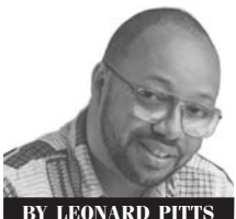
BY LEONARD PITTS

Leonard Pitts Jr. is the winner of the 2004 Pulitzer Prize for commentary and is a columnist for the Miami Herald.