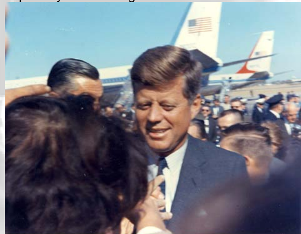
President Kennedy at Love Field, Nov. 22, 1963

Visiting the archive in Waco Texas [ 57 on map ]