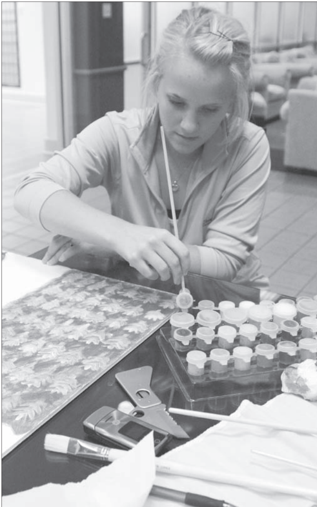
Christina Kruse/Lariat Staff

the religious electorate. More than six in 10 cited the economy as the nation's top concern. "The economic crisis that unfolded even in the last weeks of the election had a way of focusing voters minds on their pocketbook concerns," Allman said. "When juxtapositioned against McCain, voters seemed to find Obama's demeanor more comforting, more reassuring, more presidential." Despite the fact that white evangelicals between the ages 30 and 64 remained a center pillar in the Republican support base, Obama's concentrated outreach to the religious community resulted in modest gains on Kerry's percentages in Colorado, North Carolina and Ohio. The Democratic candidate's campaign may signal the beginning of reversing the prevailing stereotype that casts Democrats as worldly and anti-religious. "I believe we will continue to see various strategies with religious voters," Allman said. "I think we'll have to go through a couple more election cycles to see whether there will be a more varied voting pattern. It's a little early to tell, but however small these movements we saw, they were all in the direction of the Democrats."