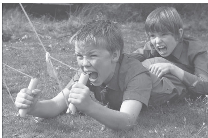
Will Poulter (right) stars as “Will Proudfoot” and Bill Milner (left) as “Lee Carter” in Garth Jennings’ “Son of Rambow,” a film that gathered the largest crowd at the Baylor International Film festival over the weekend.

like ‘Hero’ the best.” Overall, the festival was well organized in everything, ranging from the display of the films to the various extra credit sign-in sheets. The only complaint I have with the festival is that I could not read the subtitles on the screen in Castellaw due to the seating. Everyone who was not sitting on the first few rows had to strain to read the subtitles. Viewers would have to lean to one side or the other to see around a person’s head or try to look over other people, if possible. But other than the sea of swaying heads, my first impression of the festival was a warm and welcoming — as if it were a campfire experience. The films glowed like a fire, and the warmth lasted throughout the weekend. Attending the Silver Screenings were the most memorable, despite the cold. On a clear night, the outdoor screenings had an extraordinary feel to them, and the ELG’s choice to have two films in Fountain Mall was one I, and others, were thankful for. The audience reaction per-