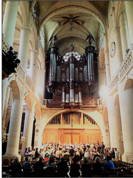
Saint-Étienne-du-Mont in Paris, France

website http://acisproductions.com/ , on Amazon.com, iTunes, and CDbaby.