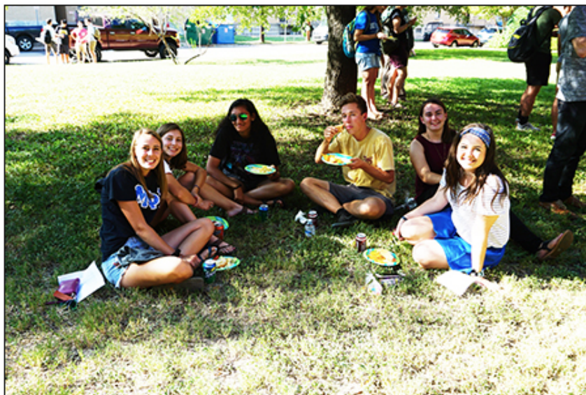
School of Music Convocation

The convocation ended with students receiving a Semper Pro Musica t-shirt and a free dinner held on the lawn of Seventh and James Baptist Church, where students could sign up for group activities, listen to the Baylor Jazz Ensemble, and spend time getting to know one another.