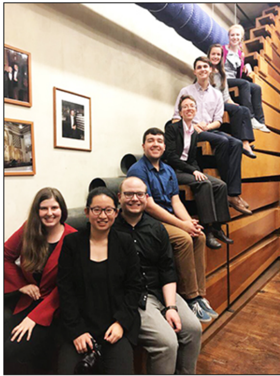
Baylor University Organ Studio in Philadelphia