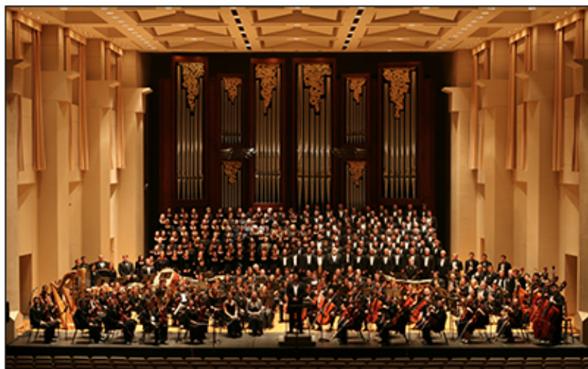
Baylor Symphony Orchestra