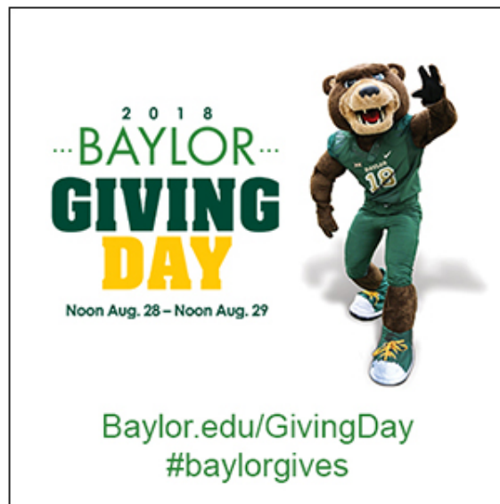
Baylor University Giving Day