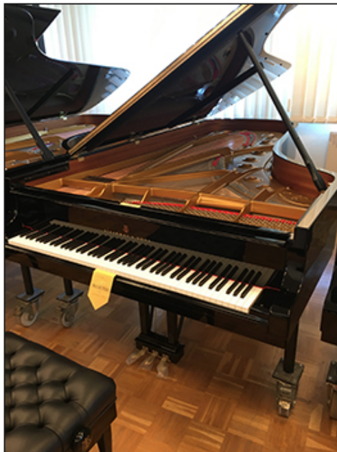
The School of Music's new Steinway D Concert Grand Piano