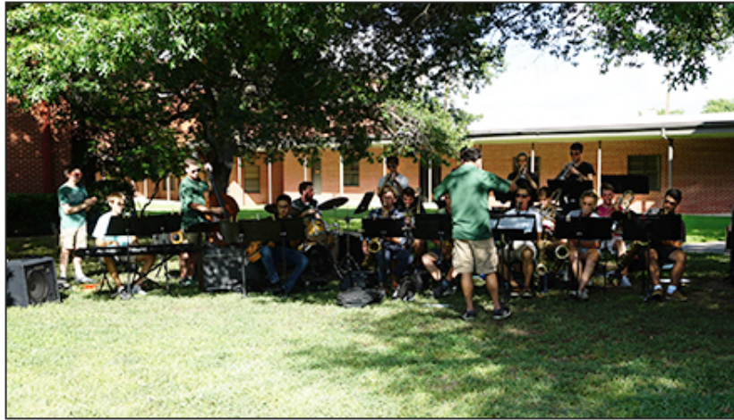
Baylor University Jazz Ensemble