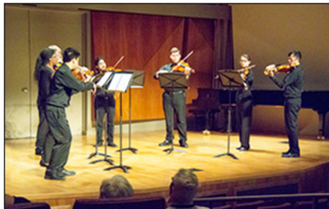
Baylor University Viola Ensemble