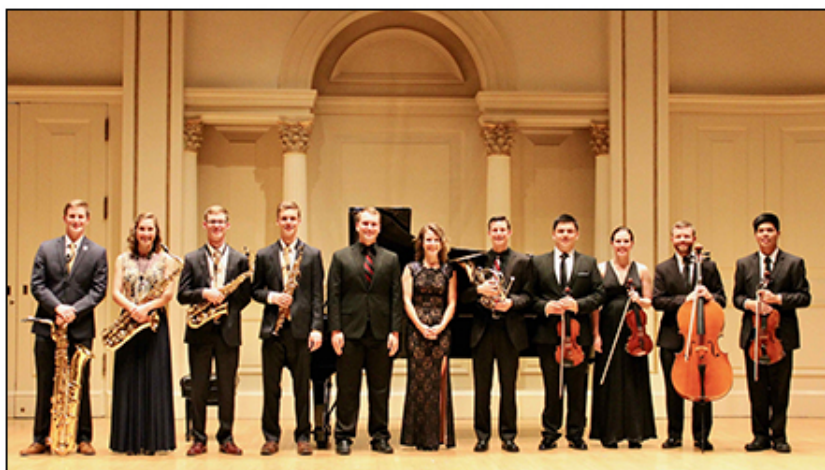
2017 Solo and Chamber Music Winners in Weill Recital Hall on May 25, 2017, prior to their Carnegie Hall debuts