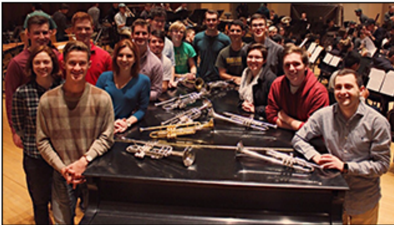
Baylor University Trumpet Students

Trumpet Ensembles Division: Both the Baylor Green and Gold Trumpet Ensembles have advanced to the Large and Small Ensemble semi-finals.