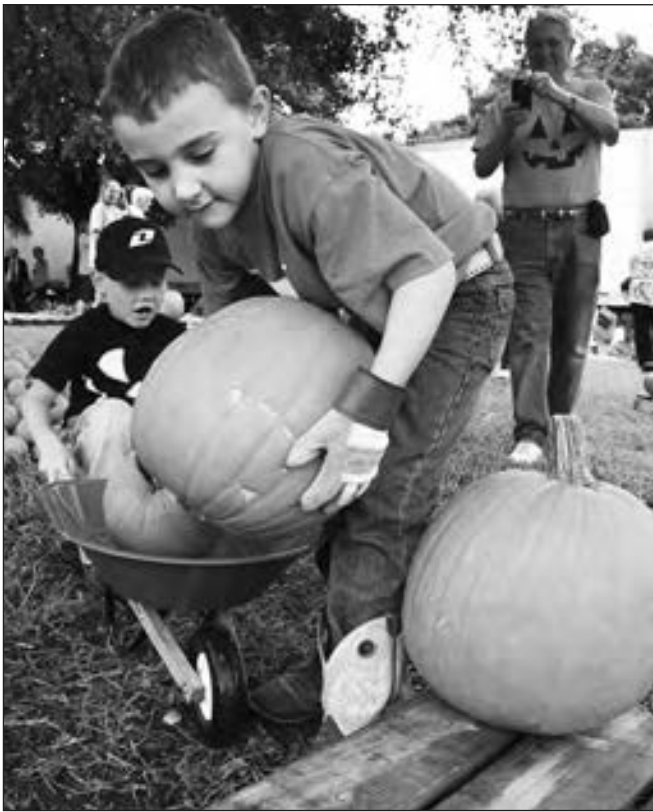
MATT HELLMAN | LARIAT PHOTO EDITOR