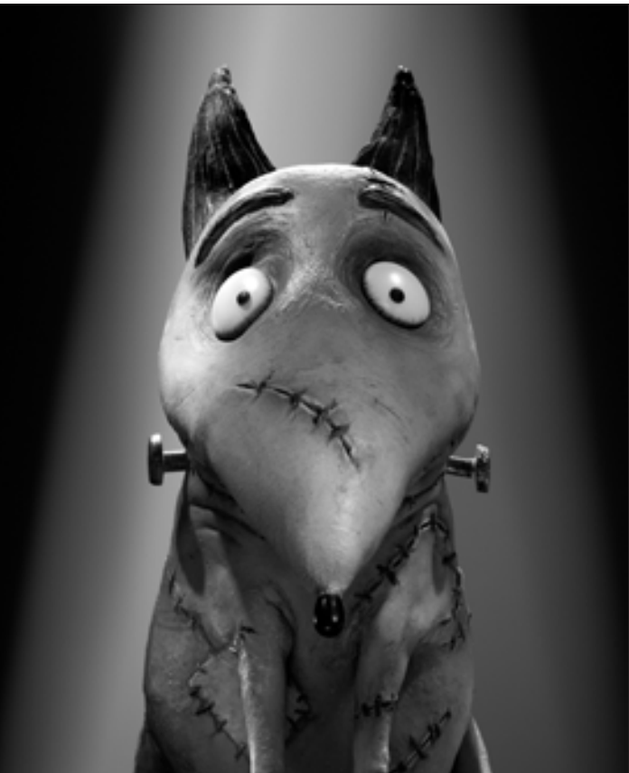
Sparky is the spunky, back-from-the-dead dog, given life by his owner Victor Frankenstein in Disney animation’s “Frankenweenie,” out this Friday.