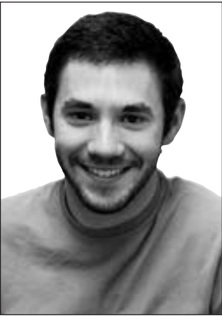
David McLain | Reporter

The United Nations General Assembly in New York is giving many international issues more prominence in the media than they normally receive. Many of these issues are not issues immediately relevant to the average college student. Our days consist of papers, projects, tests, part-time jobs and the occasional church service on Sunday. How could a nuclear program thousands of miles away, or drones dropping bombs in a land with people who speak a language