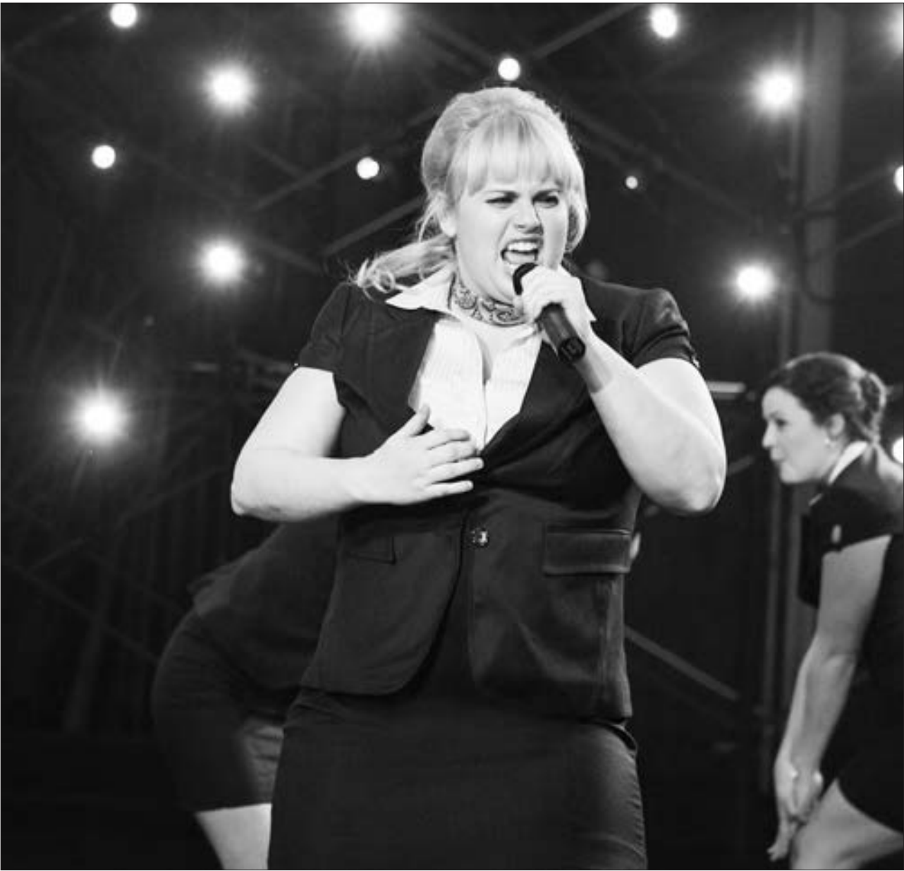
This image released by Universal Pictures shows Rebel Wilson portraying Fat Amy in a scene from her film “Pitch Perfect.” The film, in theaters last Friday, follows a girl through the awkward phases of college and her attempt to transform an acapella group into something great.