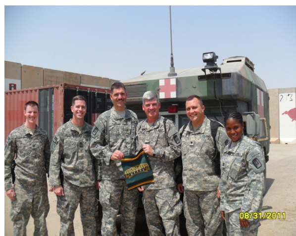
“Task Force Baylor”