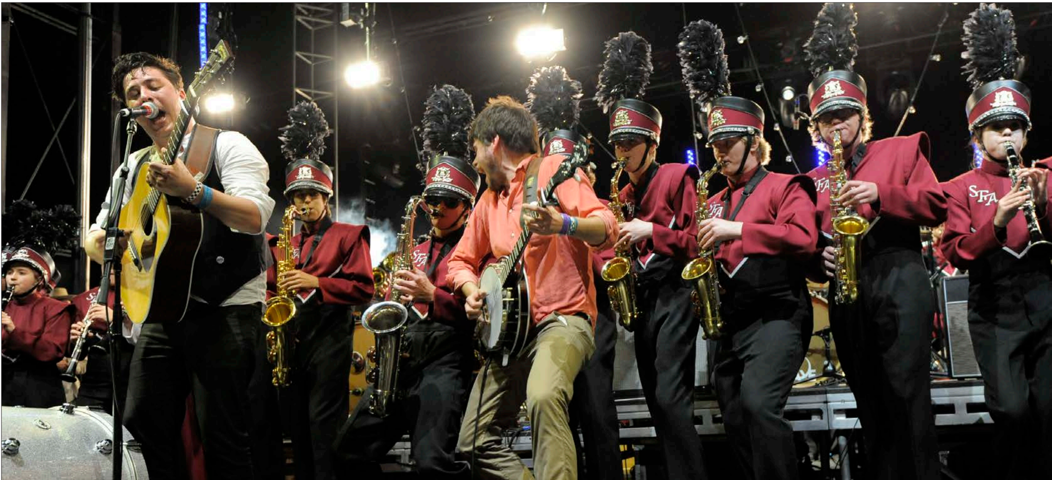
Marcus Mumford, left, and Winston Marshall, of Mumford & Sons, perform with the Austin High Marching Band at the Myspace Big Easy Express concert at SXSW in Austin, Saturday. "Big Easy Express," a documentary about Mumford & Sons, was screened at the festival before the band and others performed.