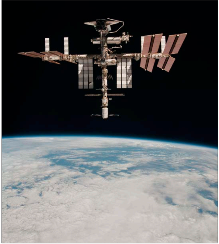
This May 23, 2011, photo released by NASA shows the International Space Station at an altitude of approximately 220 miles above the Earth. The International Space Station may provide the setting for a 500-day pretend trip to Mars in another few years.

The cost promises to be a major factor, along with the development of rocketships big enough to travel so far.