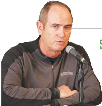
Vol. 113 No. 10