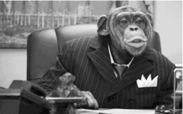
CareerBuilder.com Super Bowl ad

Most companies won’t get their money’s worth with their advertisements on Super Sunday, one Baylor business professor writes. Check Friday’s opinion section to see why Volkswagen, H&M and movie studios might entertain audiences but will ultimately fail to boost company profits.