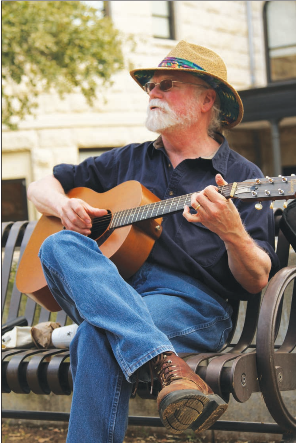
MEAGAN DOWNING | LARIAT PHOTOGRAPHER