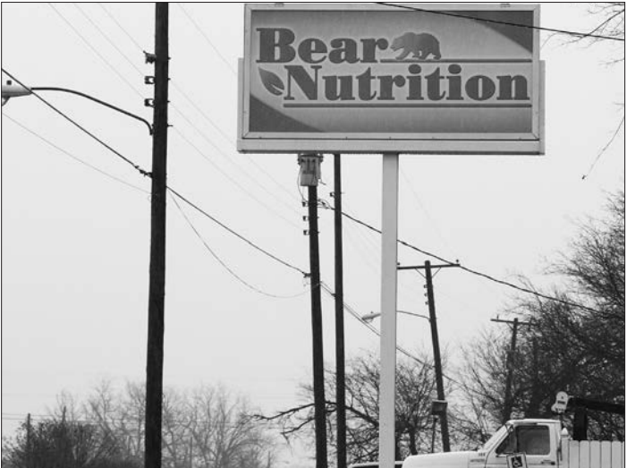
Bear Nutrition is a Health club located on La Salle Avenue in Waco and was started by a Baylor alumnus, current student and a mother.

in a 1981 assassination attempt on President Ronald Reagan, is making his case for extended time away from the psychiatric hospital where Hinckley has been confined.