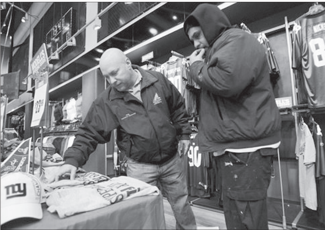
Customers shop for New York Giants' merchandise at a Modell's in New York. The Giants beat the San Francisco 49ers to have a chance at their fourth Superbowl championship. They will face the New England Patriots.