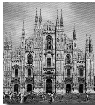
The Duomo in Milan

Day 6-7 FLORENCE: Visits include Casa Guidi, the Browning apartment; the Piazza del Duomo; Giotto's Campanile; the Cathedral (with its magnificent dome by Brunelleschi); and the Baptistry's incomparable bronze doors by Pisano and Ghiberti (said by Michelangelo to be worthy of the