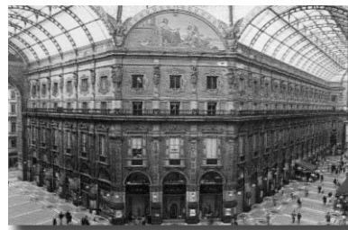
Galleria Vittorio Emanuele II

Gates of Paradise); the Piazza della Signoria, the city's most handsome square with marvelous statuary and fountains; the Uffizi Gallery with what has been acclaimed as the best collection of paintings in the world spanning the 13th to 17th centuries; and the frequently photographed Ponte Vecchio (the 14th century double-decked bridge lined with a beehive of shops). There will also be a special wreath-laying ceremony at the grave of Elizabeth Barrett