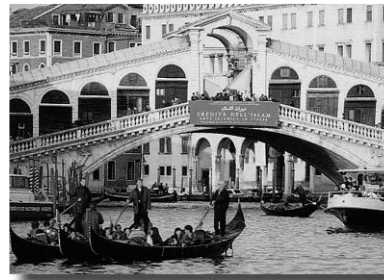
The Rialto Bridge in Venice

Day 11-12 VENICE/ASOLO/VENICE: Venice, the "Queen of the Adriatic" is considered by many to be the most unusual city in the world. Built for defense on a group of tiny islands, it is a labyrinth of 150 canals; graced by hundreds of bridges. Visit St. Mark's Cathedral, the Doge's Palace and the Bridge of Sighs, over which so many unfortunates had their last view of the outside world.