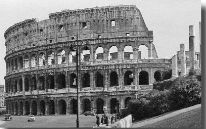
The Colosseum in Rome

be made to the Spanish Steps, St. Peter’s in Chains, the Circus Maximus and the storied Colosseum. There will be time for other sightseeing and shopping while in Rome. Day 5 ROME/SIENA/FLORENCE: Depart Rome and drive north to Siena, one of Italy’s most beautiful cities. Sightseeing will include the Palazzo Pubblico, Siena, and the Cathedral of Siena, one of the finest Gothic cathedrals in Italy. Lunch will be