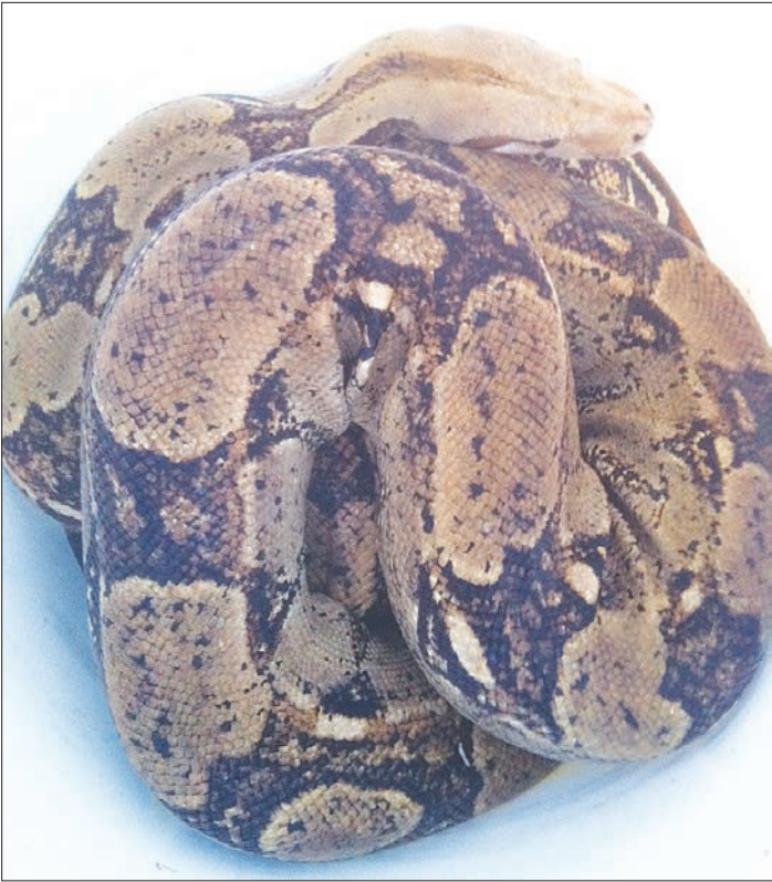
The 7-foot-long Red-Tailed Boa Constrictor captured Wednesday is not thought to be native to this area, according to officials.

The City of Waco released this playful statement Wednesday after capturing a large snake on McLennan Community College's campus.