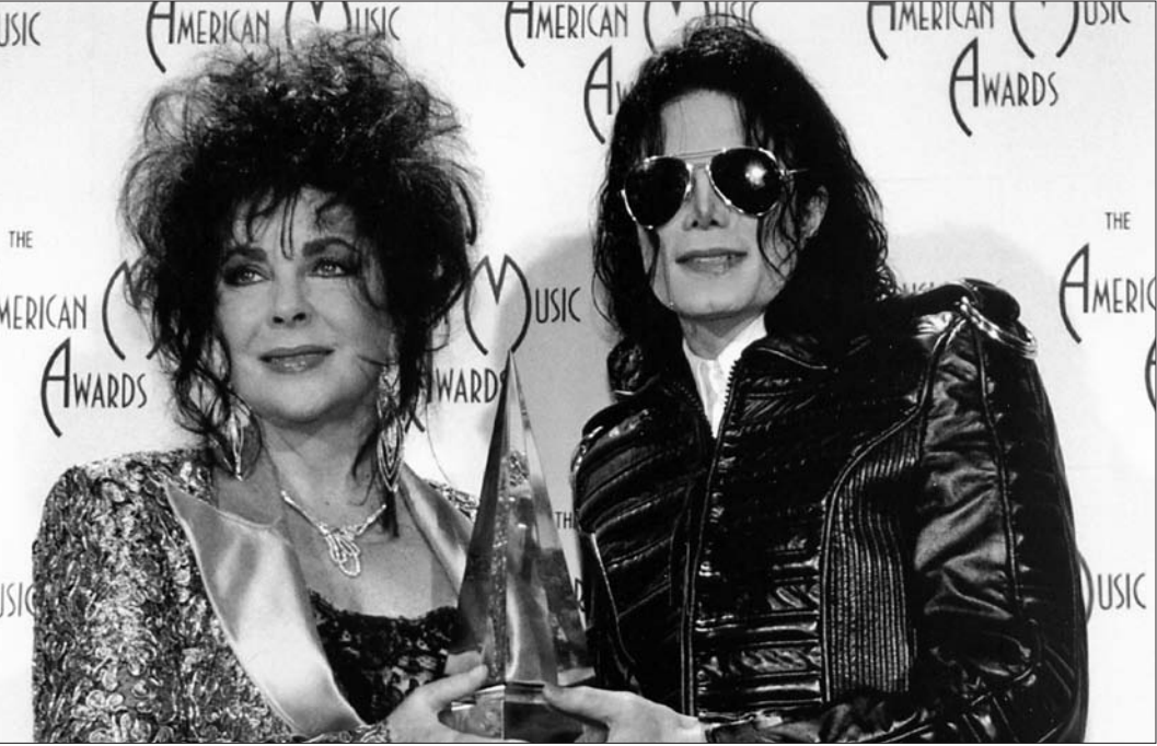
Elizabeth Taylor is shown with her longtime friend Michael Jackson in 1993.

in her life – starting with “Lassie Comes Home” in 1943 and ending with “BUtterfield 8.” Her working partnership with the volatile Mayer ended in a falling-out, and Taylor left to make “Cleopatra.”