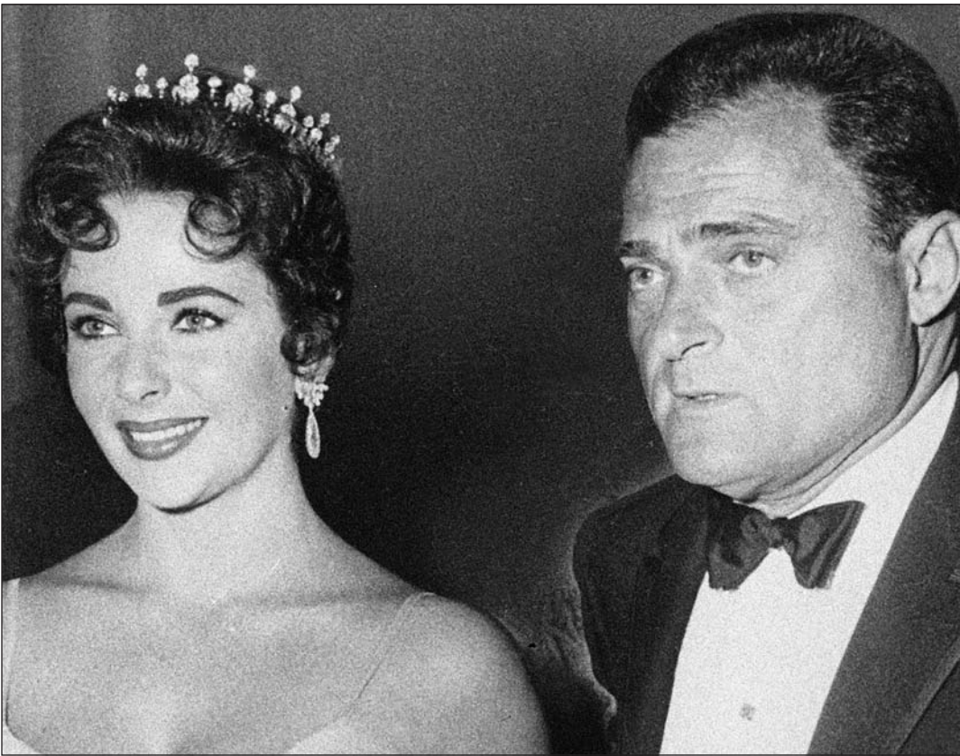
Actress Elizabeth Taylor is shown with her husband Mike Todd in 1957, the height of her career. Taylor died Wednesday at the age of 79.

After one year and one movie (“There’s One Born Every Minute”), Taylor switched to MGM, where she remained for 18 years – one of the longest relationships