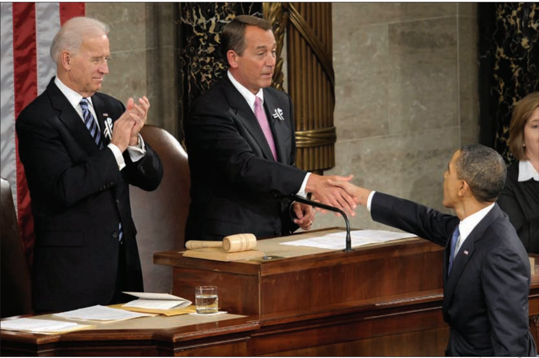
House Speaker John Boehner of Ohio shakes hands with President Barack Obama on Capitol Hill in Washington Tuesday prior to Obama's State of the Union address. Vice President Joe Biden is at left.

forward together, or not at all — for the challenges we face are bigger than party, and bigger than politics.”