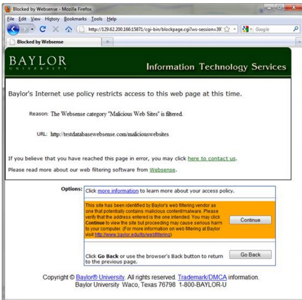
If you see the screen above, you have encountered a site that is identified as a possible threat. If you have any difficulties, please use the contact link to provide feedback. Note that the list of warning sites and the page design/content are provided by the system's vendor. ITS has little or no editing capability regarding the look of the page or the text provided.