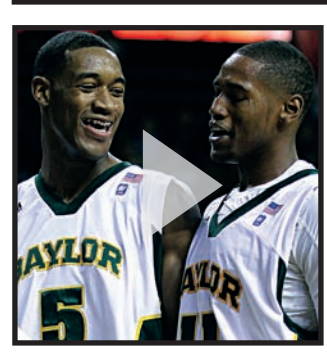
Best of the week

Be sure to browse a slideshow of The Lariat's best photos of the week, including shots of men's and women's basketball and the Dr Pepper Museum