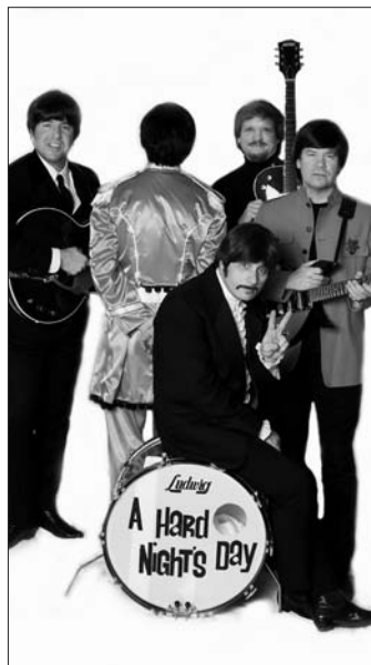
The band "A Hard Night's Day," a Beatles cover band, will perform at the Jubilee Music Festival.