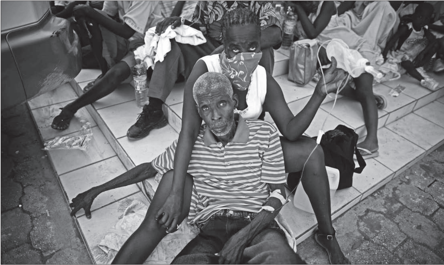
A man, suffering from diarrhea and other cholera symptoms, is held by a woman as he waits for treatment at the St. Nicholas hospital in Saint Marc, Haiti, on Friday, Oct. 22. An outbreak of cholera in rural central Haiti has killed 284 people and sickened hundreds more who overwhelmed the hospital in Saint Marc seeking treatment.

occurred along the central Artibonite River with many new instances in Haiti's central plateau. St. Marc's main hospital was the first to widely alert the epidemic as it overflowed with the sick and dying. U.N. staff have been told to avoid areas of heavy infection unless they are given special permission to go there. Guatemalan police manned a checkpoint Tuesday on the highway from Port-au-Prince to Mirebalais, a hard-hit city in central Haiti, to make sure unauthorized U.N. vehicles did not pass. Aid workers, meanwhile, scrambled to contain the spread of the disease, which has not occurred in Haiti for generations. Speaker trucks passed through neighborhoods in the capital, where a handful of cases have been confirmed in people who apparently contracted it in the countryside, advising the city's millions of residents to wash their hands. The Dominican Republic, which borders the central plateau where many new cases are being found, announced that all people crossing the border must wash hands and complete a medical form. They also stepped up military surveillance and closed a twice-weekly binational market on Monday, sparking protests on the Haitian side of the border.