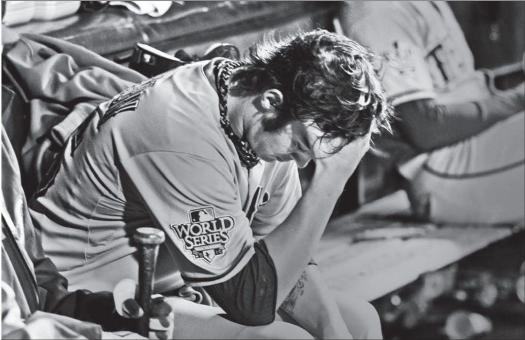
Texas Rangers' C.J. Wilson reacts after leaving the game during the seventh inning of Game 2 of baseball's World Series against the San Francisco Giants Thursday in San Francisco.