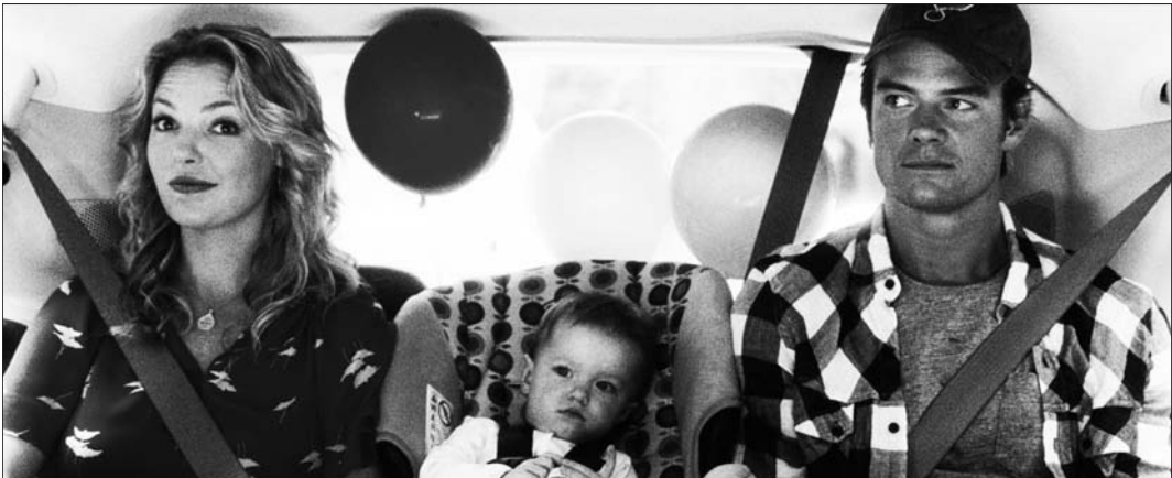
Holly Berenson (Katherine Heigl), rides along with Sophie and Eric Messer (Josh Duhamel) in Warner Bros. Pictures' and Village Roadshow Pictures' romantic comedy "Life As We Know It," a Warner Bros. Pictures release.