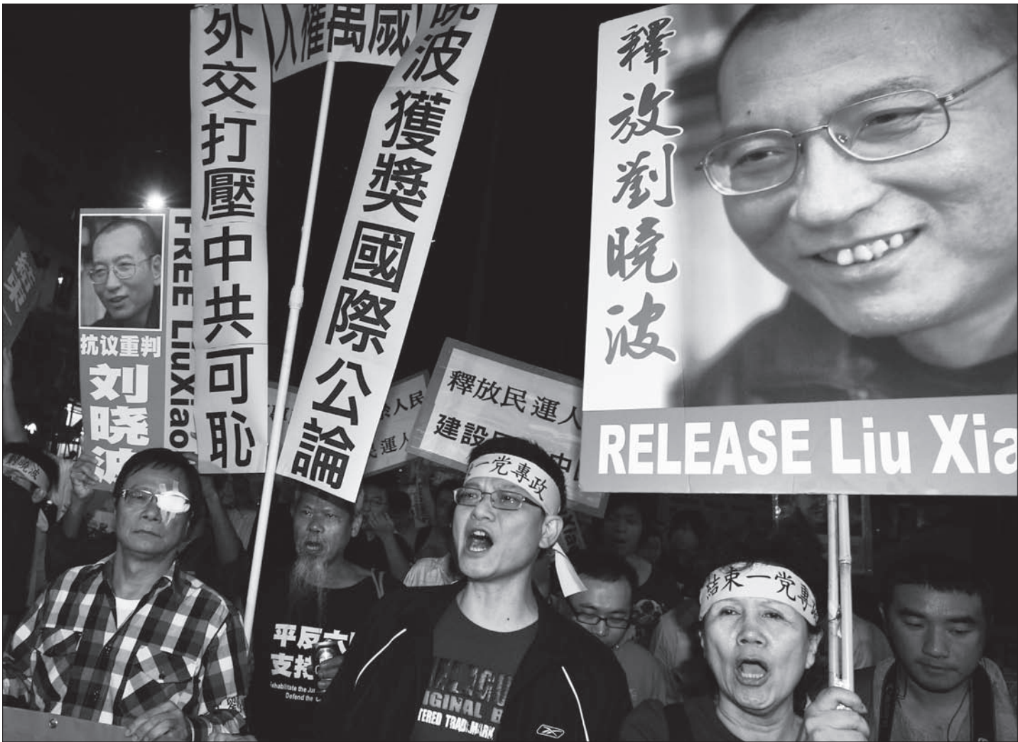
Pro-democracy protesters hold a picture of Chinese dissident Liu Xiaobo with Chinese words "Release Liu Xiaobo" during a demonstration Friday outside China's Liaison Office in Hong Kong. Liu won the 2010 Nobel Peace Prize on Friday for using nonviolence to demand fundamental human rights in his homeland.

Liu Xia has been told that if she wants to leave her home she must be escorted in a police car, the New York-based group Human Rights