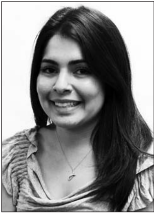
Jade Mardirosian | Staff writer

Not even the intense script of “Social Network” could give the actual Facebook the needed resuscitation it is crying out for. Don’t get me wrong. I loved the movie, packed with intellectual, attractive ivy leaguers acting like pretentious jerks. What girl doesn’t? The dramatic and witty screenplay used to illustrate the history behind the makings of the great social phenomenon of our time was interesting to say the least; however, the networking site it depicted no longer bears the same enthusiasm. Surfing the site, looking at status updates and tagged pictures of “friends” (many of whom I rarely talk to on a regular basis) barely grabs my interest anymore. The art of Facebook “research” which I worked long and hard to craft is no longer a skill I am proud to have. We all have that Facebook friend that floods our news feed,