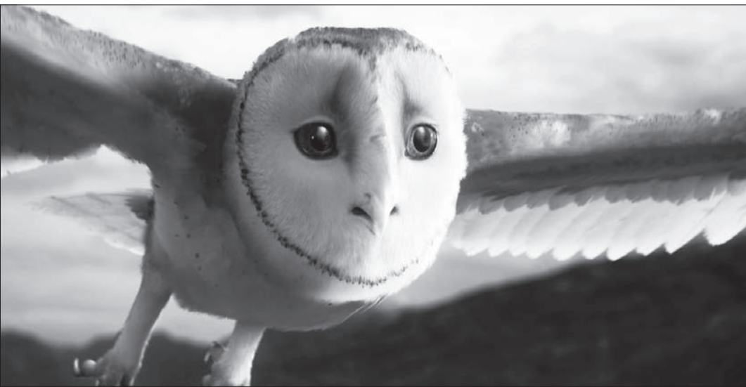
Soren, voiced by Jim Sturgess, soared into theaters last weekend in Warner Bros Pictures' and Village Roadshow Pictures' family fantasy adventure "Legend of the Guardians: The Owls of Ga'Hoole" based on the books by Kathryn Lasky.

To help cut the burger and onion tastes lingering in your mouth, you can order a famous Health Camp malt. A word to the wise — ditch the straw and embrace the spoon when you're enjoying your malt of choice. These smooth, creamy shakes in flavors from vanilla and chocolate to pineapple and peanut butter are super thick and memorably delicious (from $3.28 to $5.91). Choose any of your favorite flavors and throw them in the mix, and this malt may be just the study buddy you've been looking for.