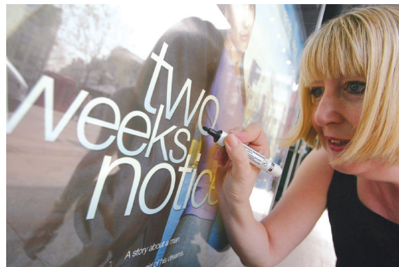
Lynne Truss adds an apostrophe to correct the movie title, Two Weeks Notice .

humor and passion, imploring "sticklers" to unite and save a "system of printers' marks that has aided the clarity of the written word for the past half-millennium . . . The reason to stand up for punctuation," she says, "is that without it there is no reliable way of communicating reason."