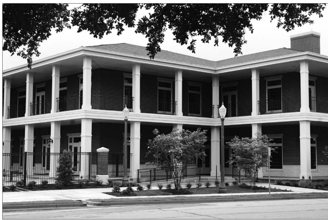
The new McMullen-Connally Faculty Center sits between Speight and Bagby avenues on South Fifth Street. The dedication ceremony will be held Oct. 3.