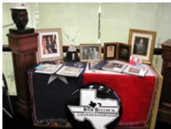
Bob Bullock plaques, awards, and memorabilia on display at the Archive opening.