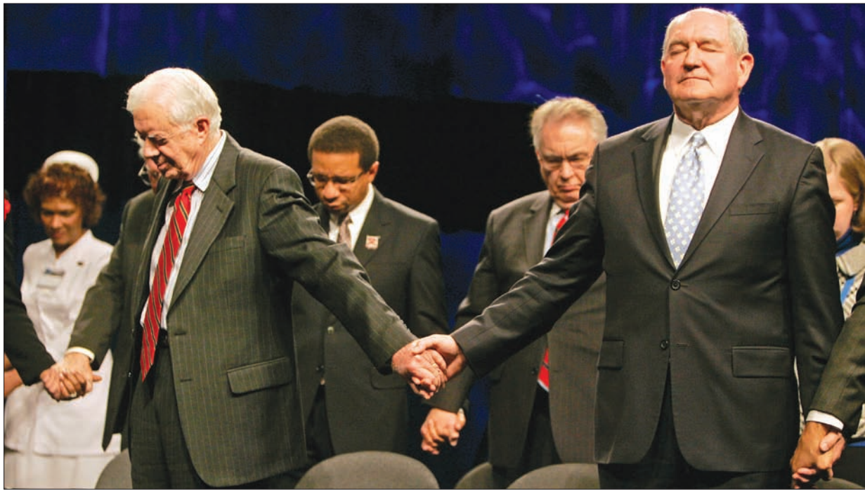
Former President Jimmy Carter, left, and Georgia Gov. Sonny Perdue pray Wednesday during the opening session of the New Baptist Covenant in Atlanta.