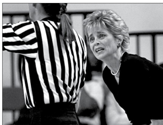
Women's basketball head Coach Kim Mulkey pleads with a referee during the Lady Bears' 71-56 win over Texas Sunday. Baylor is 10-3 in conference play and tied for first in the Big 12.