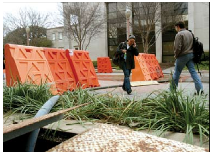
Students weave through barricades, water and hoses Monday between the Hankamer School of Business and the Speight Plaza Parking Garage after a broken water line left the area damp Sunday evening.