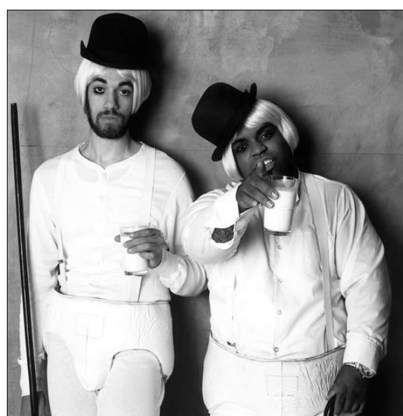
Danger Mouse, left, and Cee-Lo Green are the masterminds behind the duo Gnarlz Barkley. St. Elsewhere features the hit single "Crazy," which leaked months before the album's March 13 release.

Those songs didn't just resuscitate Green: They became the