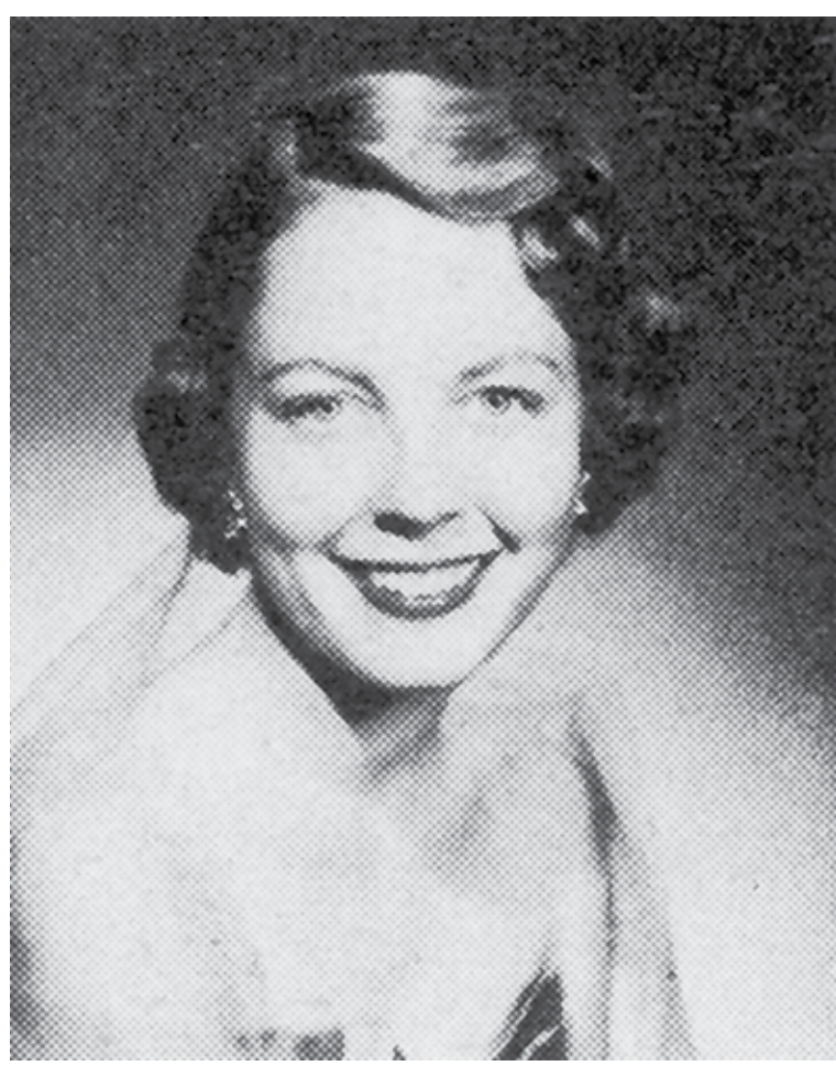
Ann Willis (Richards) Class of 1954 (Governor of Texas, 1991-1995)

will be taken until Friday, Nov. 10, in the CUB (the lounge area nearest to the Student Government office) in the SUB. Portrait sessions last from 9 a.m. to 5 p.m., and all you have to do is walk in.