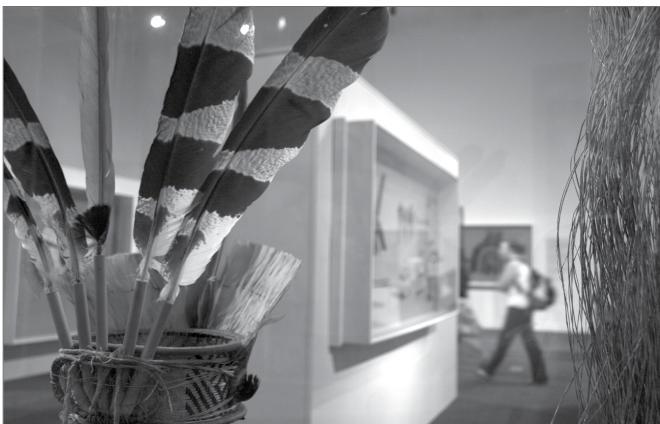
Tribal feathers adorn the Mayborn display of "Feathered Treasures: Ceremonial Objects of the Amazon." Regional tribes represented include the Mayna and Shuar. The exhibit will remain at the Mayborn until Oct. 8.

ITS is working on ways to deal with phishing e-mails, but warns that they're here to stay.