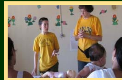
practica, internships, & theses