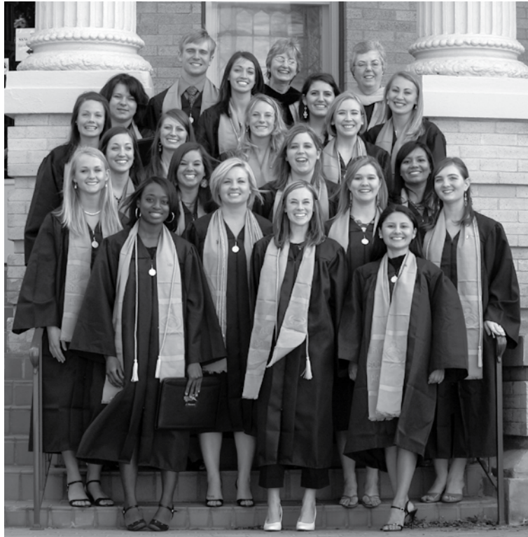
The May 2008 graduating class of BSW students.