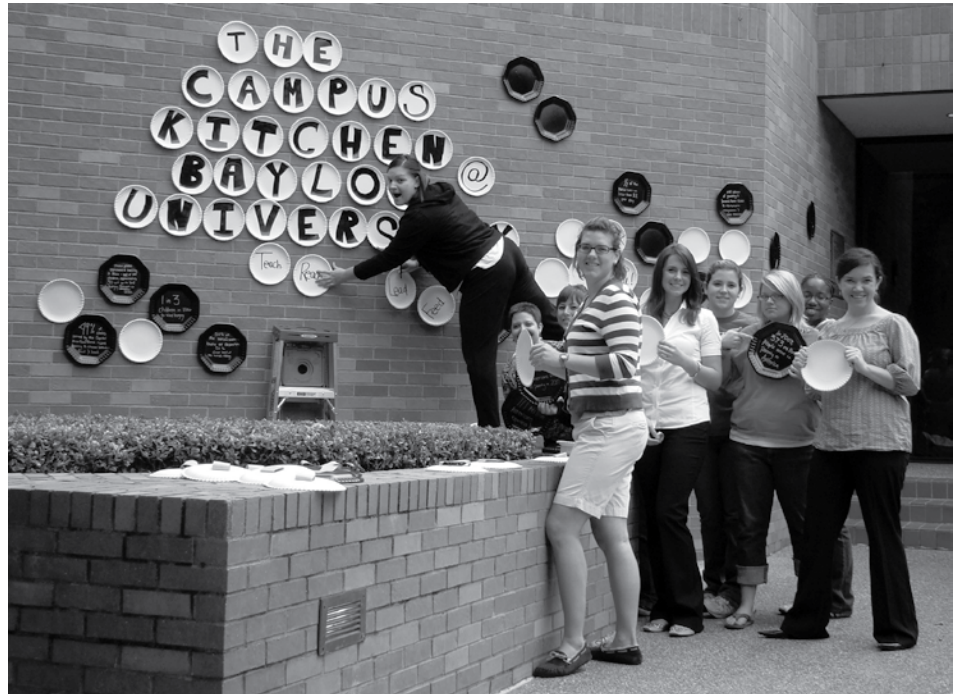
Baccalaureate and graduate social work students readied for the official kick-off event Nov. 12 at the Bobo Spiritual Life Center during which 20 people signed up to volunteer.

So, yes, I'm proud of our students! I'm proud of Baylor for taking this concrete step to provide for its neighbors. One more thing, the BUCK program will begin full-time operations on a day that seems especially fitting - Jan. 19, Martin Luther King Day.