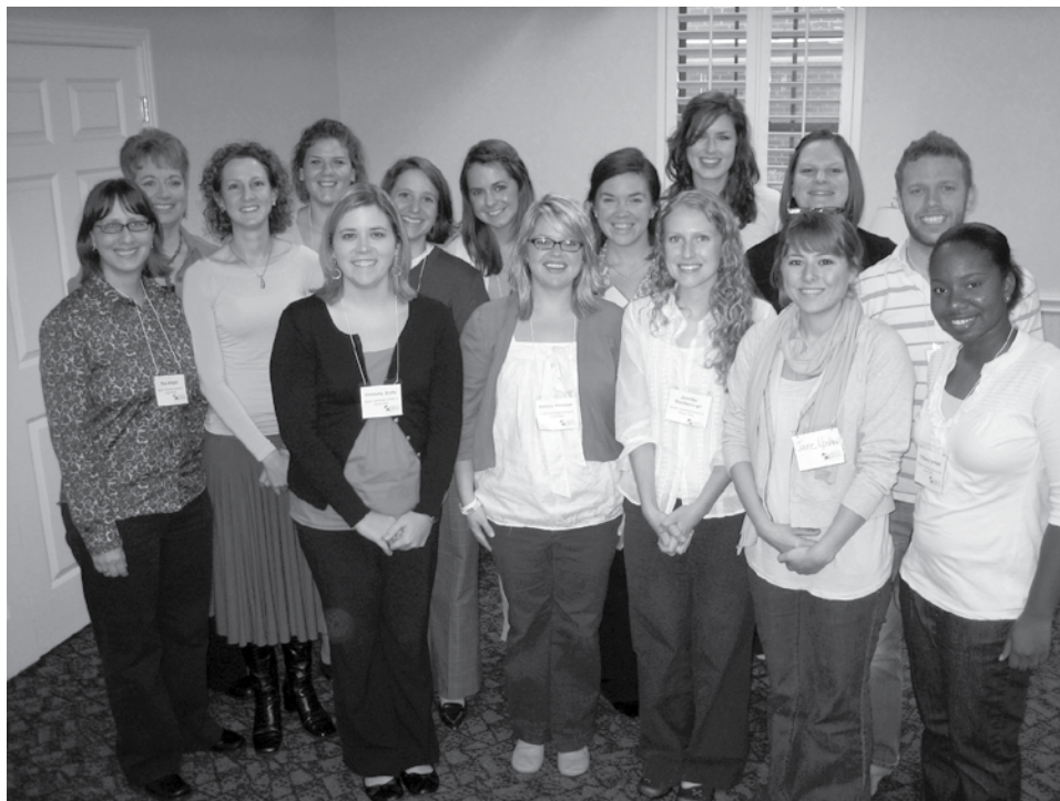
Fifteen students were in the congregational social work specialization this fall, pictured here at the Walking Alongside Workshop on Addressing Poverty in Your Community.

"It speaks to the incredible passion and commitment of our students that they are choosing to do more work