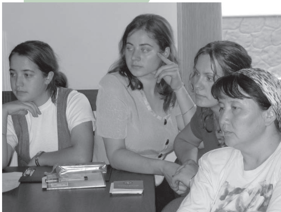
Students in the College's social work program come from Eastern Europe and Central Asia. It was not uncommon for classroom discussion to be translated in three languages to accommodate the diversity in the College.

For more information, contact Preston Dyer at (254) 710-6230.