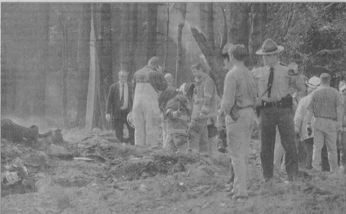
Firefighters and emergency personnel investigated the scene of a fatal crash involving a United Airlines Boeing 757 with at least 45 passengers yesterday morning near Shanksville, Pa., in Somerset County.

nuclear arsenal and is designed to deal with threats such as the spread of weapons of mass destruction and biological, chemical and nuclear weapons. After 4 p.m., when Washington was little more than a ghost town, Mr. Bush took off for the nation's capital. Air Force One was flanked by two F-16 fighter jets and one F-15 during the flight. Top congressional leaders, including House Speaker J. Dennis Hastert, Minority Leader Richard A. Gephardt, Republican Whip Tom DeLay, Senate Majority Leader Tom Daschle and Senate Republican Leader Trent Lott, returned to Washington after being taken to a secure government facility in northern West Virginia.