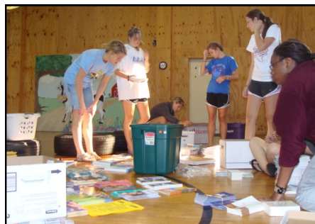
FLO Students serving at Talitha Koum

the grounds for their first service project. Additionally, funds raised from their annual Freshman Frontier and Freshman Formal events were donated to Mission Waco and World Hunger Farm. Members also served at these two sites to learn about the work they do for the Waco area. It has been an amazing year of relationship building, learning, and service to the community.