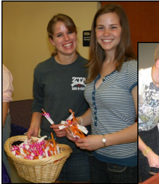
Servant Leadership Course Group Service Project at West Avenue Elementary