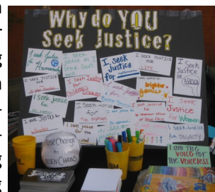
Justice Week Display Board