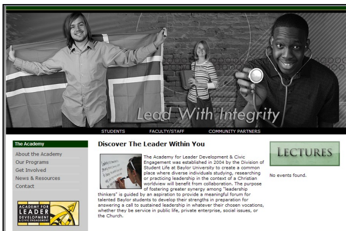
Screen shot of our new entry page

Academy staff and the Information Technology Department have been working on the launch of a new website layout that will be more user-friendly and better reach out to our varied audiences. The website will be launched in the coming months. Please stay tuned for the fresh new look with endless photos highlighting our outstanding students.