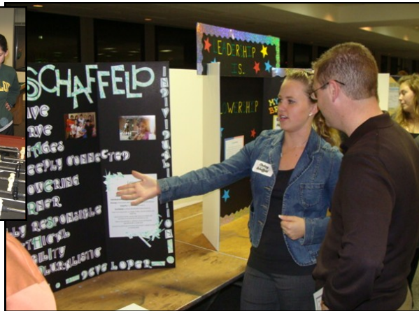
Introduction to Leadership Course Fall 2008 Leadership Celebration