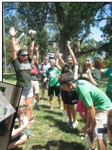
Celebrating at the Retreat