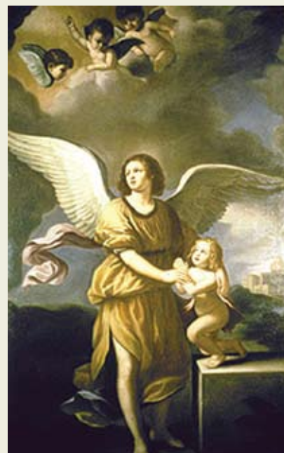
L'Angelo Custode by Guercino (Giovanni Francesco Barbieri), 1640, Civic Museum, Fano, Italy